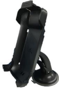
CRD-TC2X-VCH1-01 TC2X In-Vehicle Holder