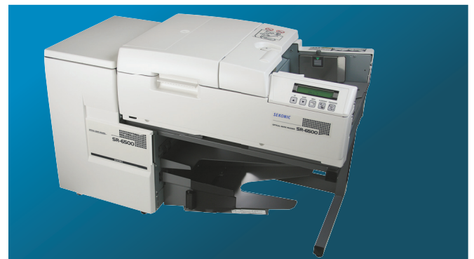
SR-6500 (Main body + Select Stacker)

We provide OMR to many fields all over the world.