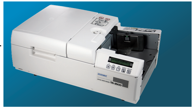
SR-3500 / SR-6000 (Main body)

Or others, you can feel free to select operating software made for our OMR's.