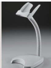
> AS-8310/AS-8312 stand